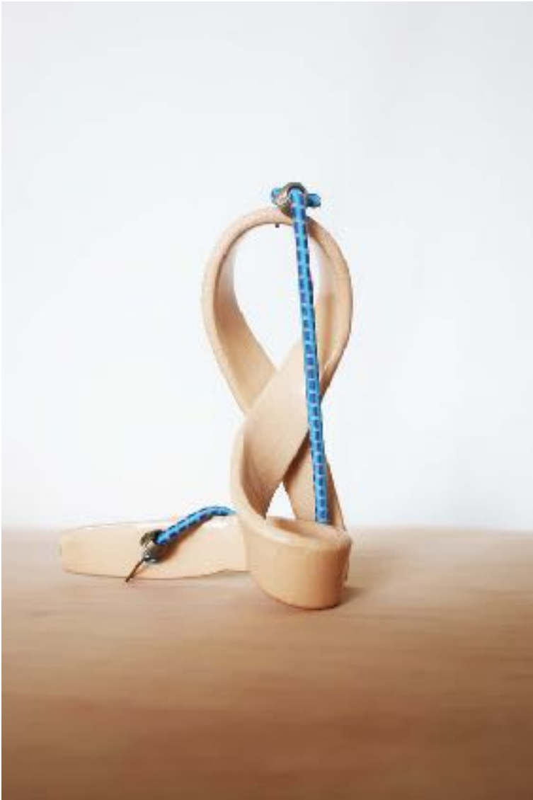
Title: Elasticity Materials: Ceramic, Bungee

" In the hands of this criticism categories like sculpture and painting have been kneaded and stretched and twisted in an extraordinary demonstration of elasticity, a display of the way a cultural term can be extended to include just about anything" (Krauss. R. 1979. Sculpture in the Expanded Field)